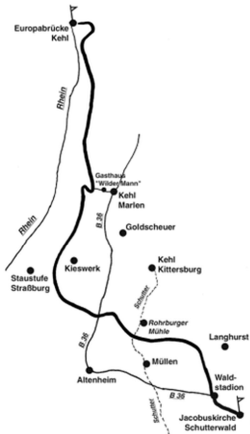
7. Etappe von Schutterwald nach Kehl / Strassburg

SCHUTTERWALD - Schutter/Rohrburger Mühle - Müllen - B36 – Jakobus cross - Pierre Pflimlin Bridge - Rhine dam - weir - nature trail - Rhine bank - KEHL