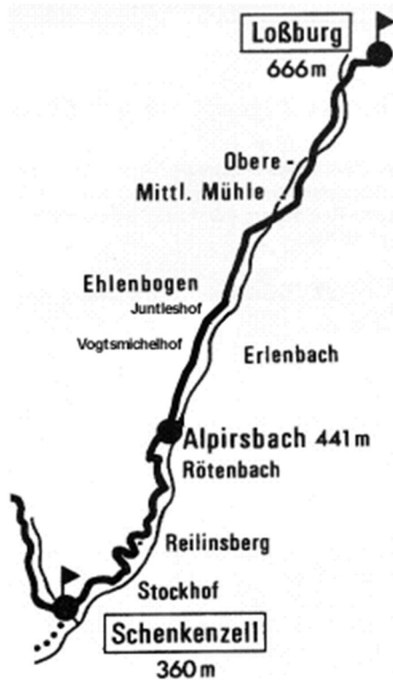
1. Etappe von Loßburg nach Schenkenzell

LOSSBURG – public swimming pool - Upper and middle mill in Ehlenbogen