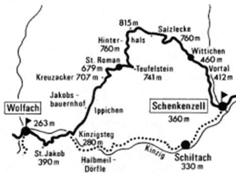
2. Etappe von Schenkenzell nach Wolfach

SCHENKENZELL - Wittichen monastery (4 km) - salt lick (4 km) - devil's stone - St. Roman (4 km) - Kreuzacker - Vor Ippichen (4 km) - St. Jakob (3 km) - WOLFACH (2 km).