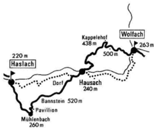
3. Etappe von Wolfach nach Hausach

WOLFACH - memorial - White Cross - Käppele (3 km) – new timber work road - Hausach (3 km) - Hausach/Dorf - Pfarrberg - Ried - Bannstein (6 km) - Mühlenbach (2 km) - Waldsee - HASLACH (4 km)