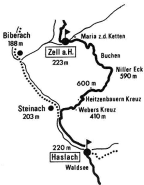
4. Etappe von Haslach nach Zell am Harmersbach

HASLACH – Kinzig bridge – Kinzig dam - underpass (B33) (4 km) - Webers Kreuz - Oberentersbacher Hütte - Niller Eck/Buchen (10 km) - Buchwaldhof - pilgrimage church Maria zu den Ketten - ZELL AM HARMERSBACH (5 km).